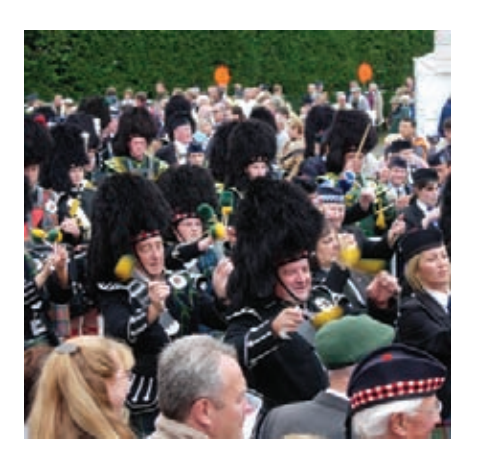
Braemar Gathering