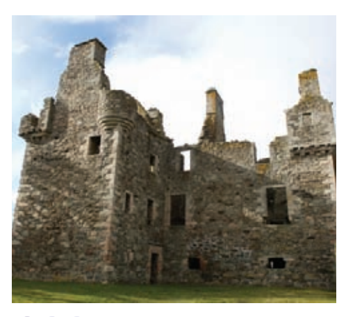
Glenbuchat

with that of people involved in managing the Park will feed into the second National Park Plan. It's a five year strategy that will be the basis for focusing attention on the Park's most pressing issues.